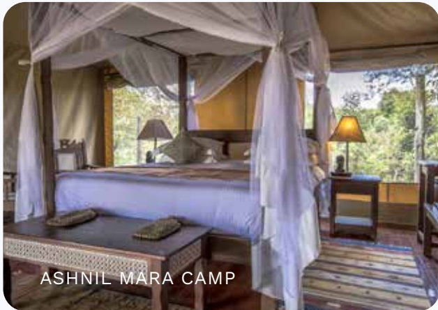
ASHNIL MARA CAMP