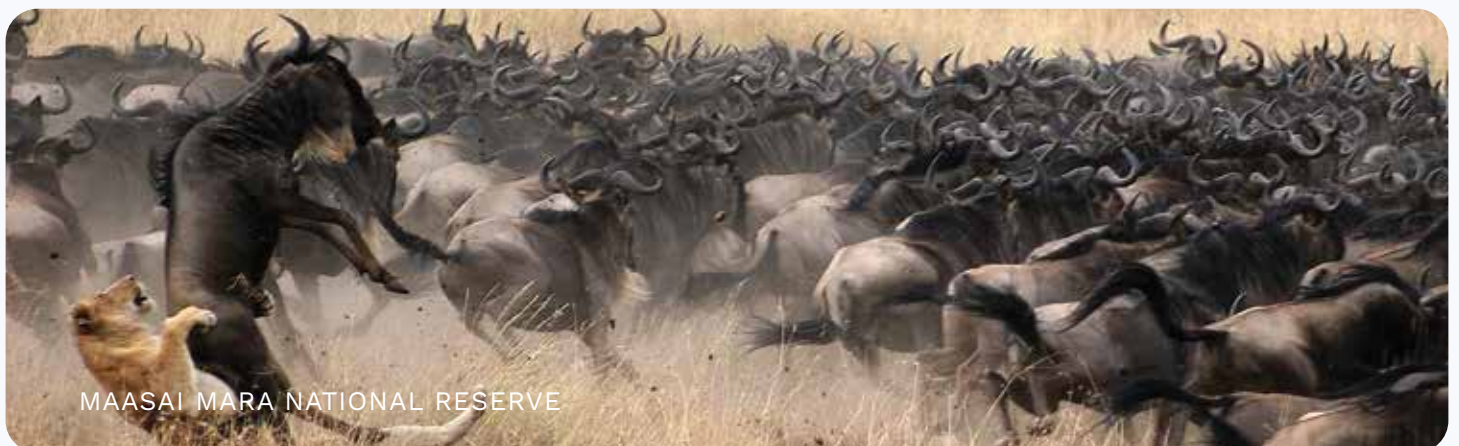
MAASAI MARA NATIONAL RESERVE