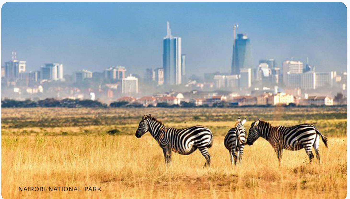
NAIROBI NATIONAL PARK